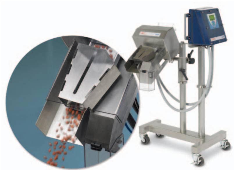
Figure 1 — The Thermo Scientific APEX 500 Rx pharmaceutical metal detection system showing detail of the rejection system. The system is placed at the outlet of the tablet press, deduster, or capsule filler. Every product coming off the production line passes through its aperture and is metal detected.

With lines operating at fast speeds and machine parts in repetitive motion, often vibrating, it is possible for a small metal component to become dislodged and unintentionally find its way into the product. The contaminants can vary from small screws, washers to metal shavings and thin wires.