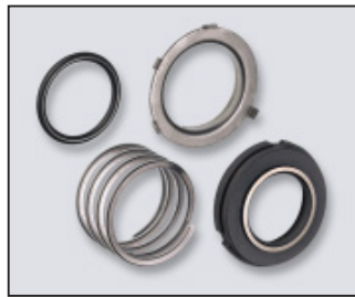
KIT 3: O-Ring, Cup, Spring, Carbon