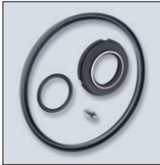
KIT 1: O-Ring, Carbon, Impeller Pin, Casing Gasket