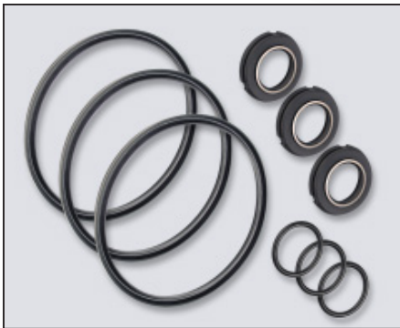
KIT 2: Casing Gaskets, Carbons, O-Rings